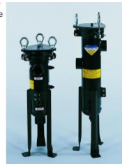
Shown with our optional adjustable support legs.